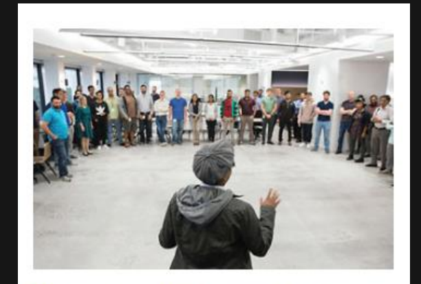
INTEGRITY AND COMPLIANCE We are committed to the highest standards in everything we do.

We provide resources and financial support to causes around the world and encourage employee volunteerism.