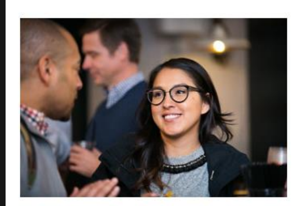
INCLUSION AND DIVERSITY

Discover how we use our technologies to improve the efficiency of products and processes.